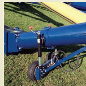
10" & 13" hydraulic wheel kit with double leveling jacks