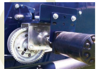
Hydraulic hopper winch

H10" reverser can be added on to existing augers. Easy switching from forward to reverse with ball-snap disconnect.