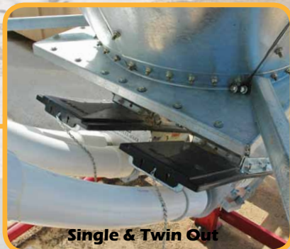
Single & Twin Out