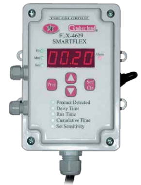
SMARTflex Control Unit