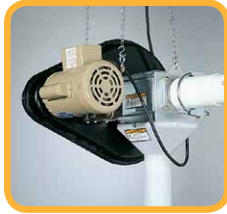
Belt Drive Unit