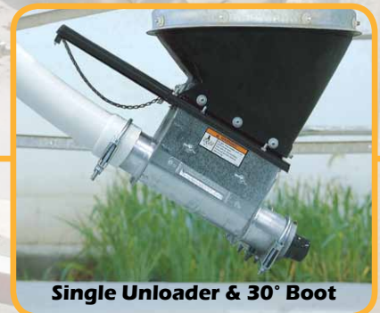
Single Unloader & 30° Boot