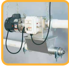
Direct Drive Unit

The Flex-Flo™ auger is driven by a 1/3 to 1-1/2 hp, totally enclosed, fan cooled motor at a standard 358 RPM (other speeds available for special applications). Whether direct or belt driven, the drive system includes an easily accessible maintenance port, a safety back up switch and visible light warning of back ups in the feed line, and automatic thermal shut-off switch.